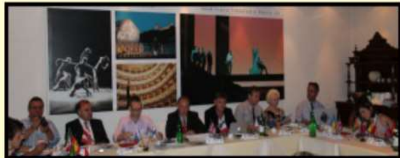
2012 - Italy