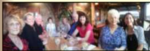
2013 - Victoria, BC, Canada