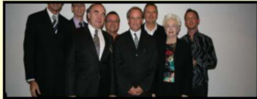
2010 - Croatia - Elected