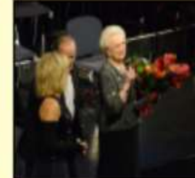
2014 - Salzburg, Austria