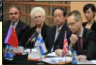
2011 - Shanghai, China