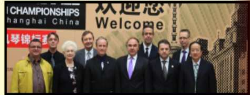
2011 - China