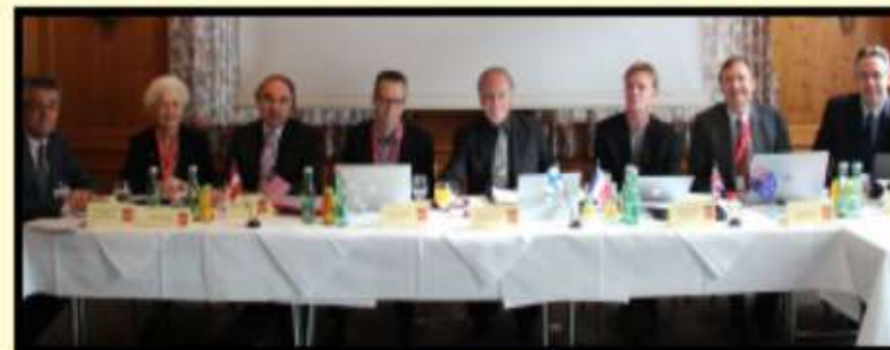
2014 - Austria - Retired