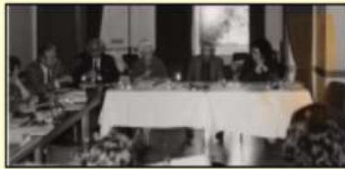
1985 - Paris, France