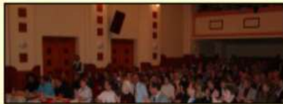
2004 - Pontarlier, France