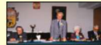
1986 - Bialystok, Poland