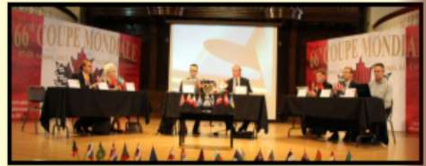
2013 - Canada