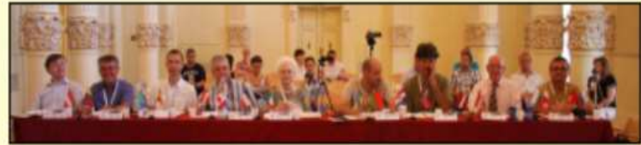
2012 - Spoleto, Italy